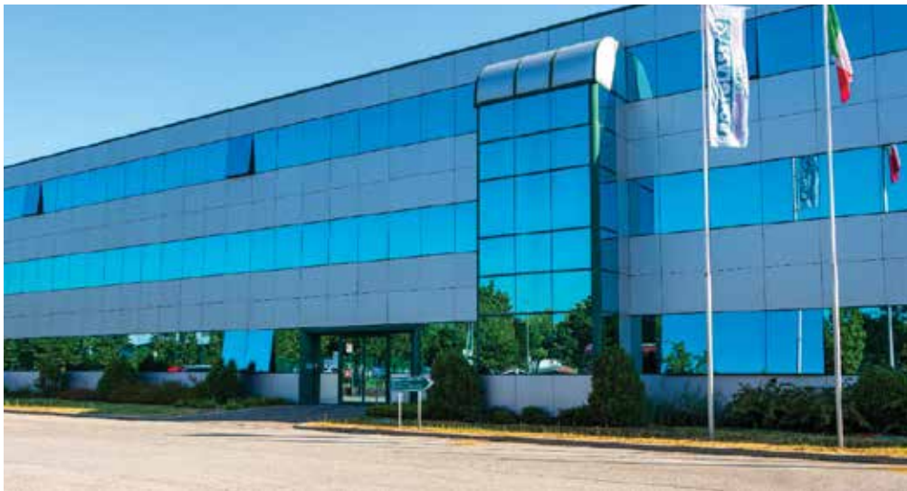
Figure 1: Polyglass S.p.A. head quarter

This analysis shall not support comparative assertions intended to be disclosed to the public.