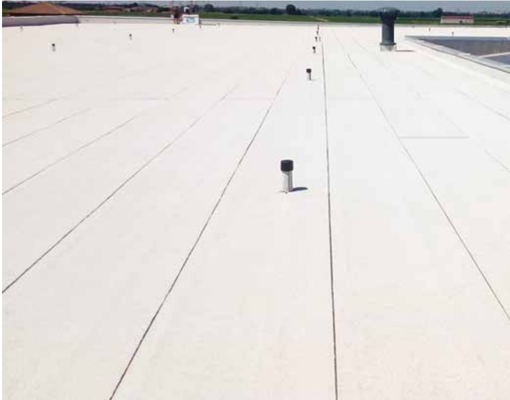
Figure 3: Polyflex Light Evolution P G F