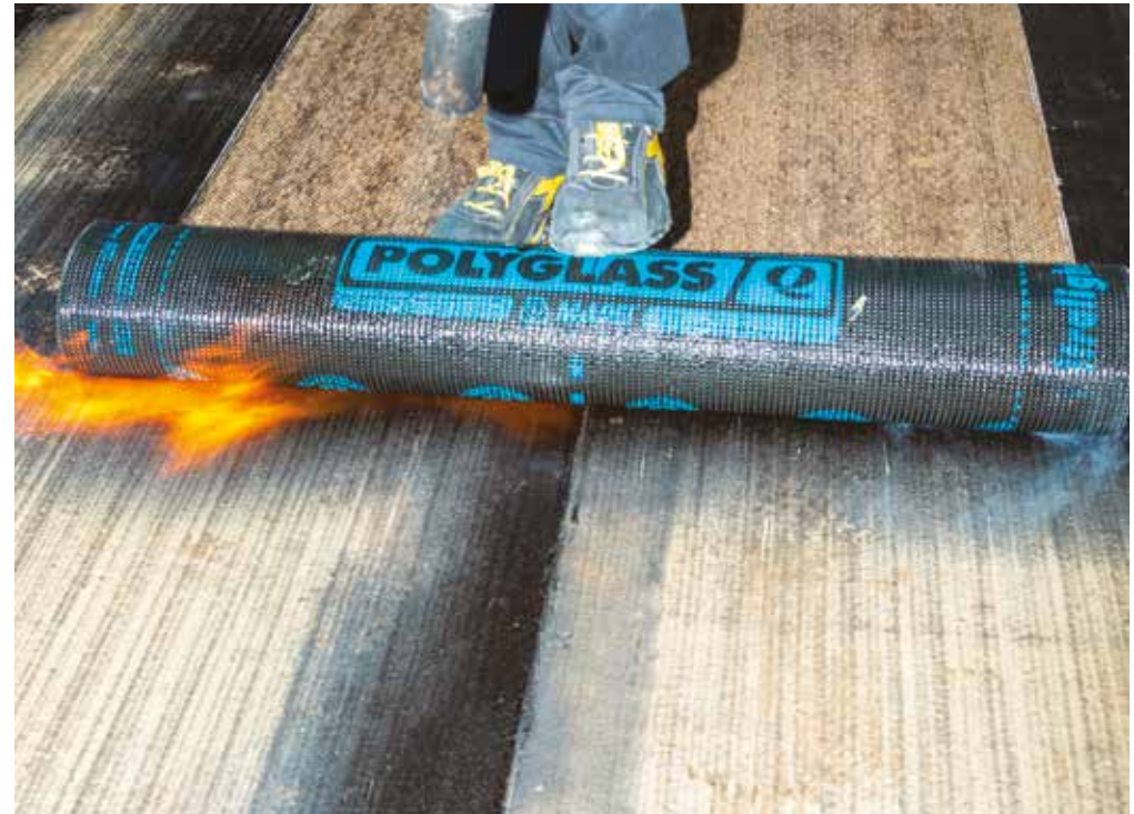
Figure 4: Polyflex Light Evolution P application

Transportation modules, especially A4, have relevant importance in terms of GW_{Pluluc} , while the contribution became less relevant in the other environmental categories.